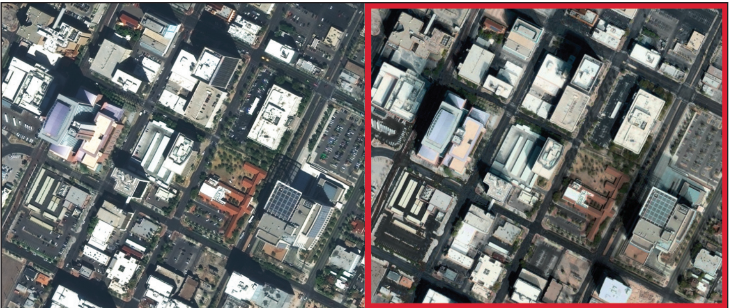
Left: Traditional orthorectified imagery of Las Vegas. Right: Vricon True Ortho, without parallax or occlusion.